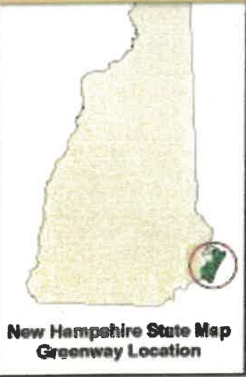
New Hampshire State Map Greenway Location

NHDOT Project #26485 Transforming Abandoned Railroad into a Non-motorized 7.9-Mile Rail Trail