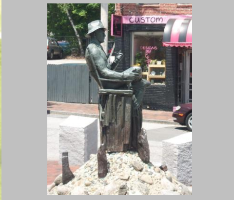
First person to name this statue on a trip we took wins a $25.00 gift certificate to McQuirks!!!!