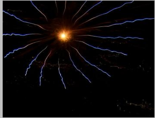
The WinterFest 2012 fireworks has been saved by LOCO Running's generous donation!!!!